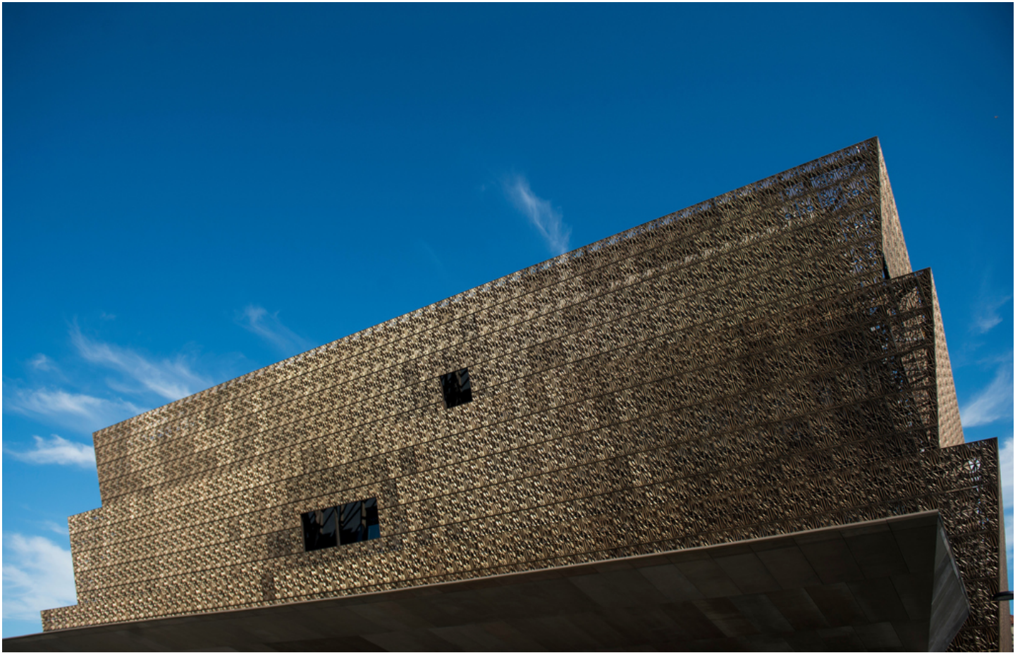
The Museum of African American History and Culture is a great place to celebrate Black History Month in D.C.

Tim Scott goes to a museum with Donald Trump