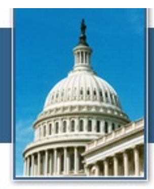
August 5, 2021