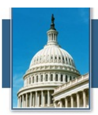
March 25, 2021