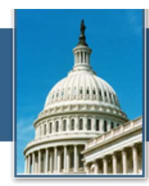
November 11, 2020